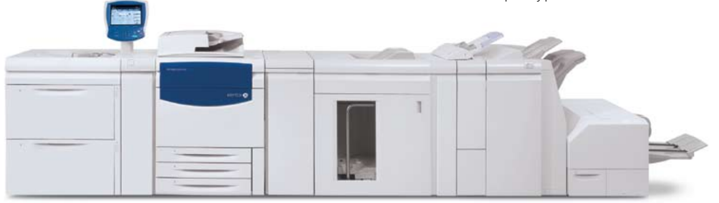
Above configuration not supported by the Integrated Fiery Color Server

The Xerox 700's finishing options greatly expand the range of applications you can finish inline. Produce high-value applications including: face trimmed saddle-stitched booklets, catalogs, punched documents, square folded and trimmed manuals, tri-fold brochures and variable print postcards, direct mail, photo specialty products and more.